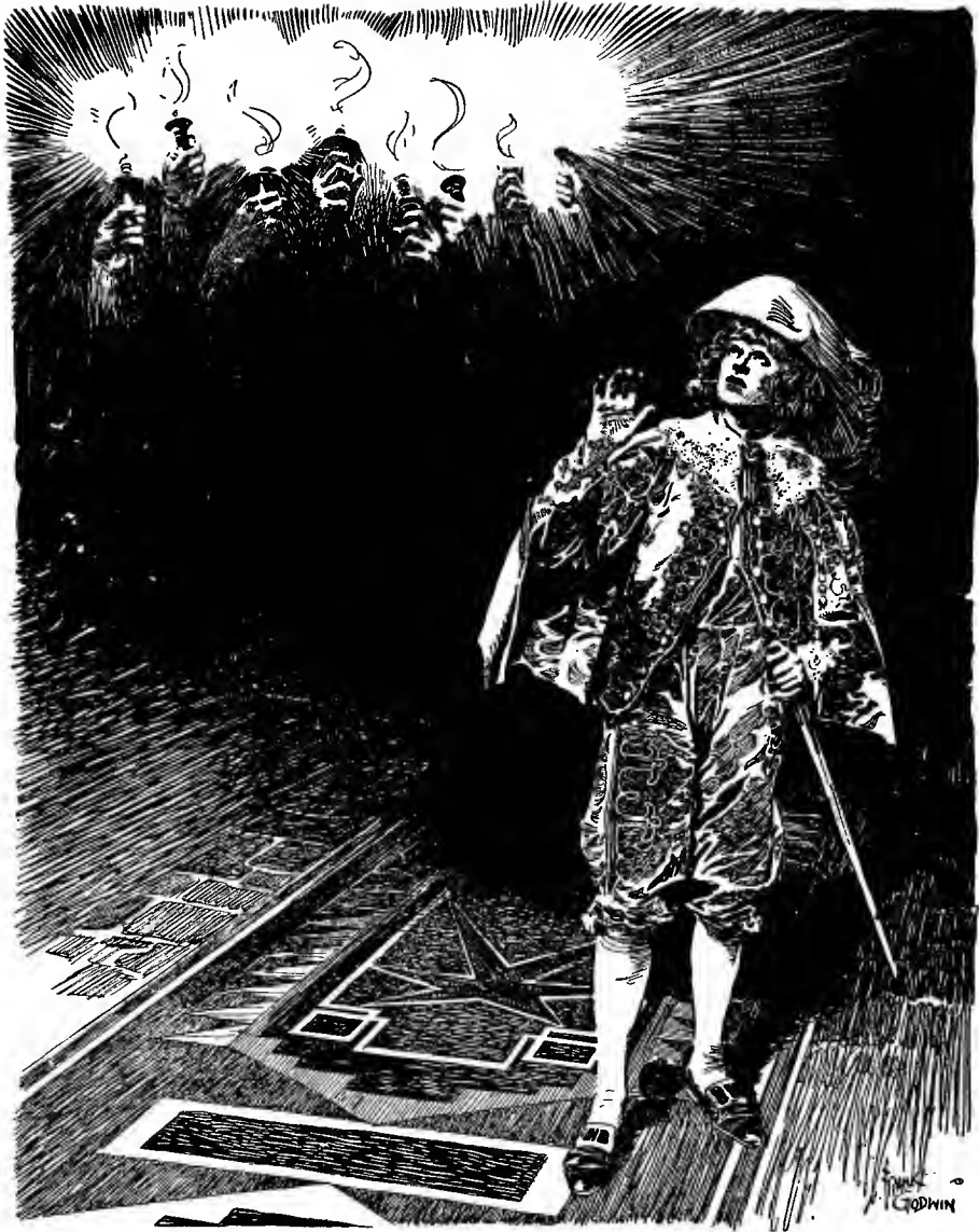
The Prince could see nothing but a number of hands in the air, each holding a torch.