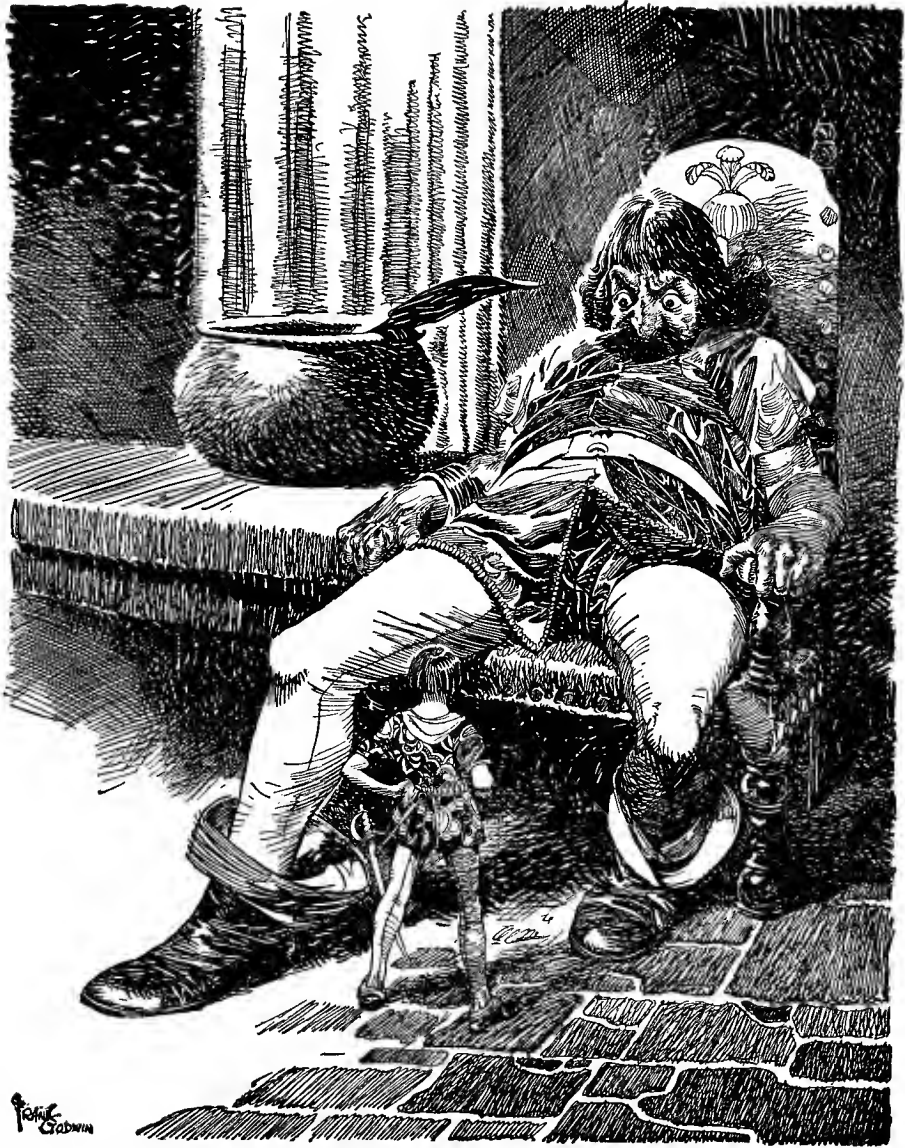
The giant started when he saw him, and began to stammer out: “Oh! dear me; is it you?”